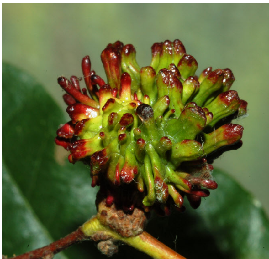
Asexual gall of Andricus grossulariae on acorn.