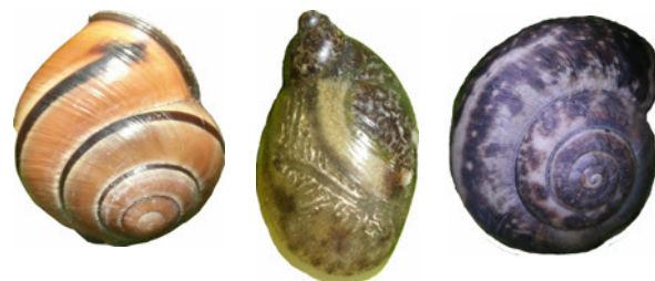
Left-right: Dark-lipped Snail Cepaea nemoralis , Amber Snail Succinea putris , Kentish Snail Monacha cantiana .

Virtually all our snails can be identified from the adult shell so if you find any interesting shells do collect them. I am very happy to receive any images as well as both shells and living mollusc specimens to offer help with identification. Slugs and land snails will survive for a few days in a container supplied with damp cardboard. My contact details are at the back of the newsletter.