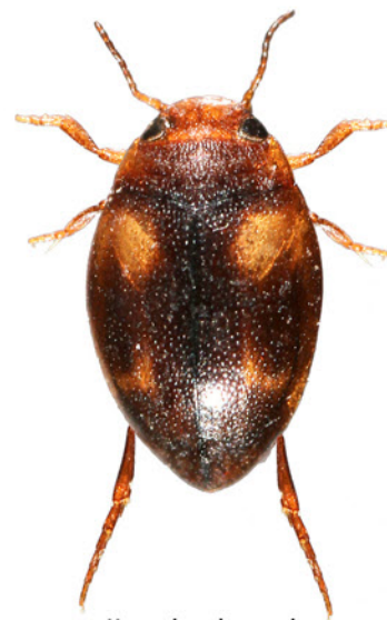
Hygrotus decoratus 2.2 - 2.6 mm