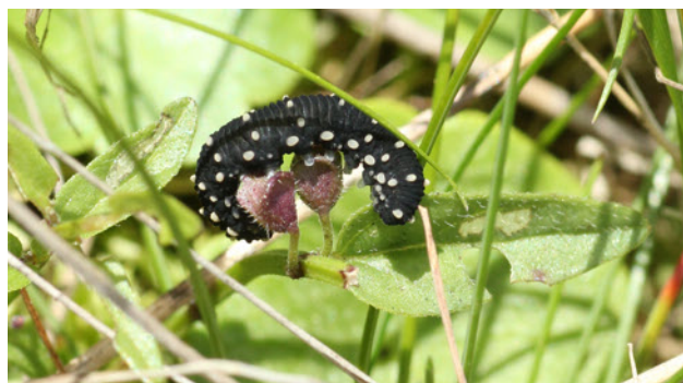
Larva of a sawfly Athalia scutellariae .